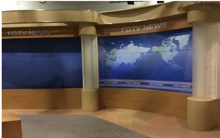
Figure 4. Using the broadcast aesthetic: Religious Christian broadcast studio at the Yoido FullGospel Church in Seoul, 2016.

The journalistic style includes engagement with controversy and issues of public concern. In these videos, we identified extensive reference to conflict-based issues that relate to Christian communities.