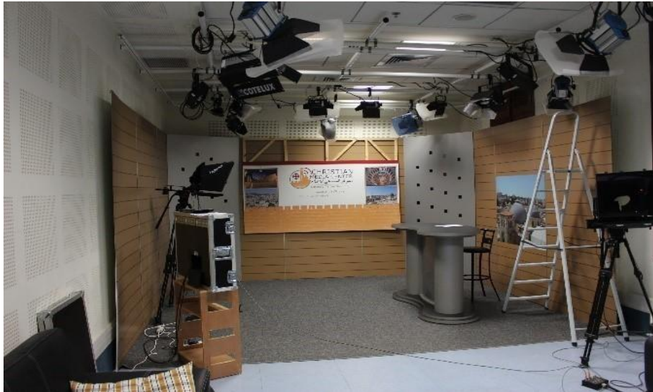
Figure 3. Simulating Western journalist studios: Media Center in Jerusalem, 2017.

It should be noted that this practice is not exclusive to the Franciscan/Canção Nova operation, and can be observed among other denominations and faiths. For example, the main Pentecostal movement in South Korea operates a similar studio for broadcasting sermons from the grand Yoido Full Gospel Church in Seoul (see Figure 4).